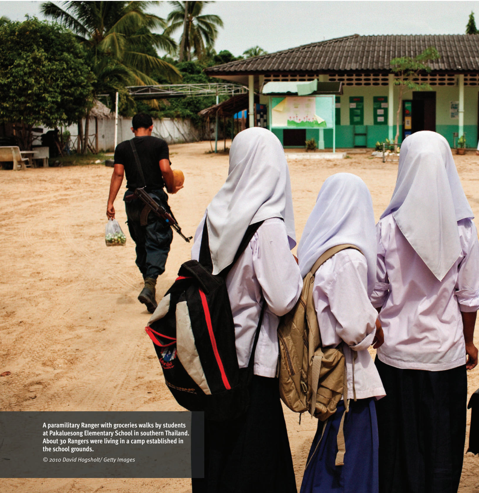
A paramilitary Ranger with groceries walks by students at Pakaluesong Elementary School in southern Thailand. About 30 Rangers were living in a camp established in the school grounds.