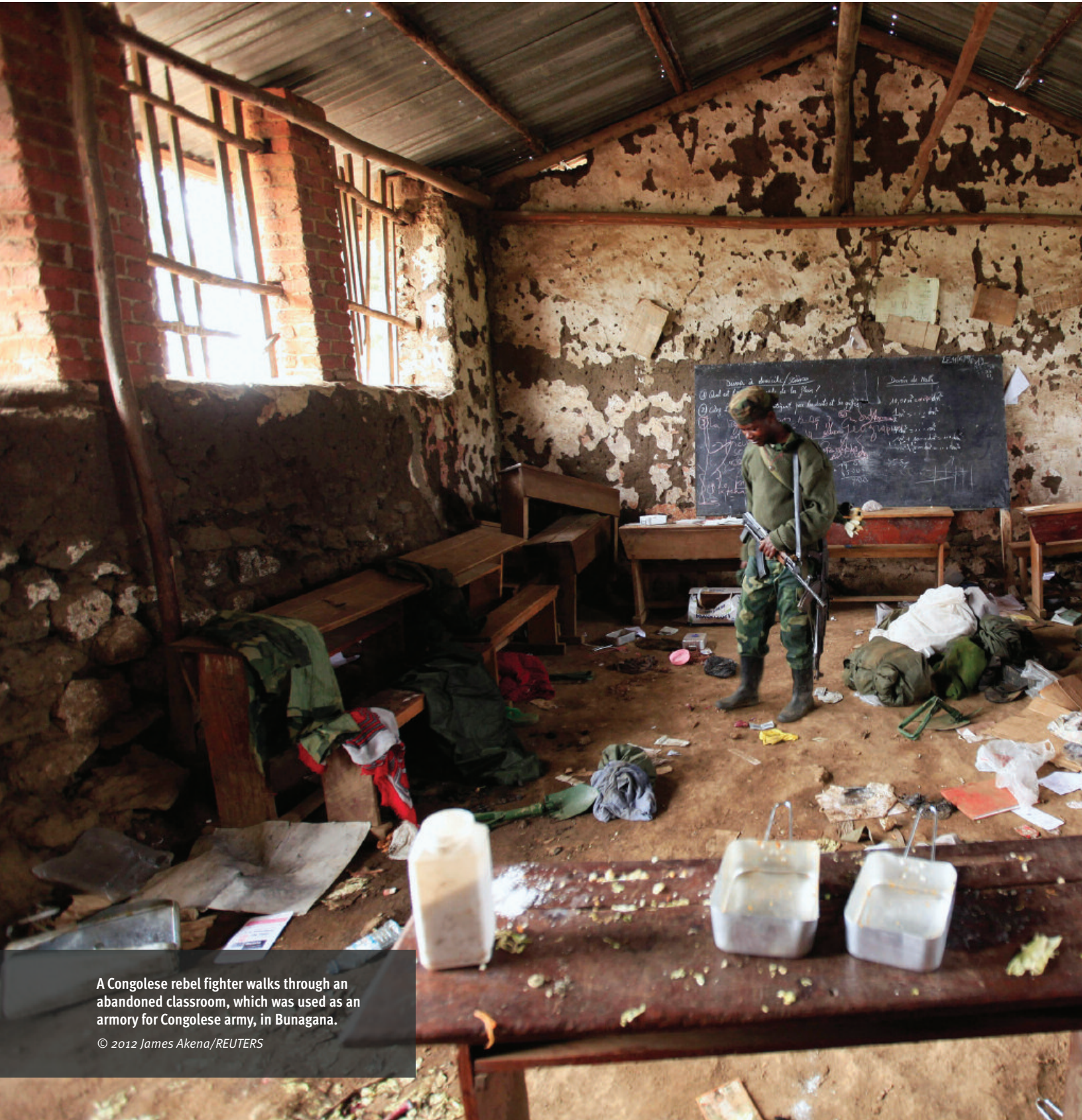
A Congolese rebel fighter walks through an abandoned classroom, which was used as an armory for Congolese army, in Bunagana.