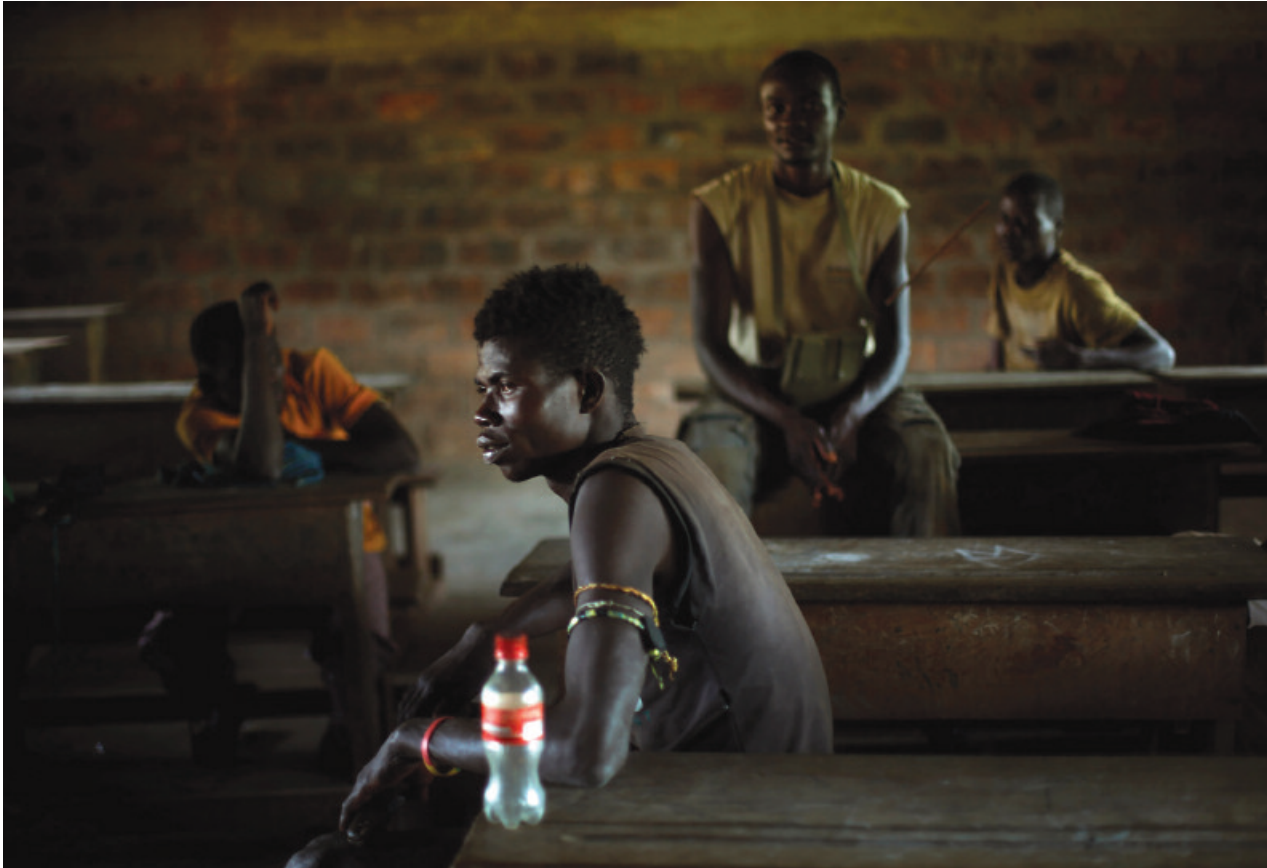
Former FARCA (Central African Republic Forces) soldiers linked to Anti-Balaka Christian militiamen sitting in a school set up as a camp in Bangui, Central African Republic, on December 15, 2013.