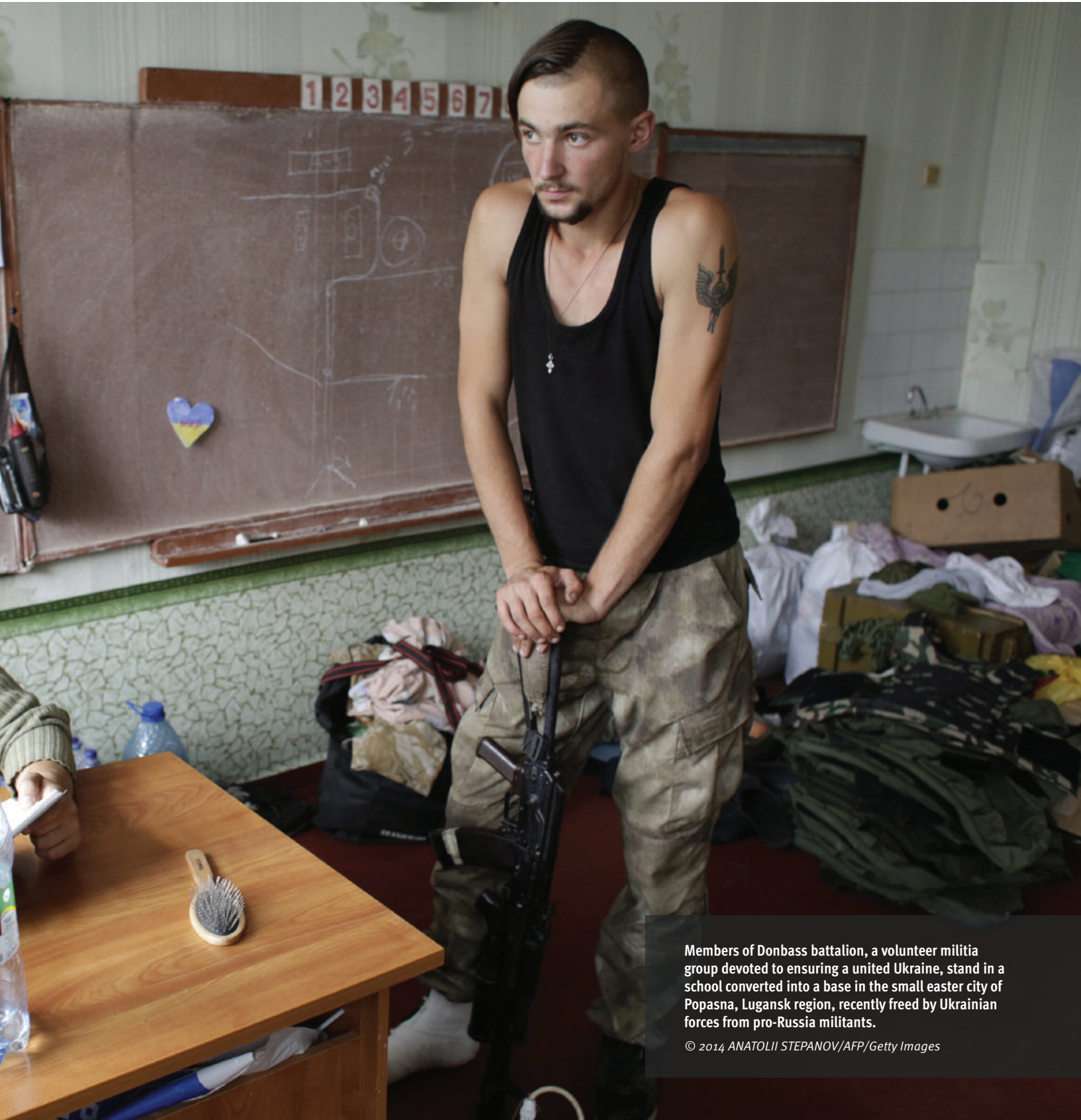
Members of Donbass battalion, a volunteer militia group devoted to ensuring a united Ukraine, stand in a school converted into a base in the small eastern city of Popasna, Lugansk region, recently freed by Ukrainian forces from pro-Russia militants.