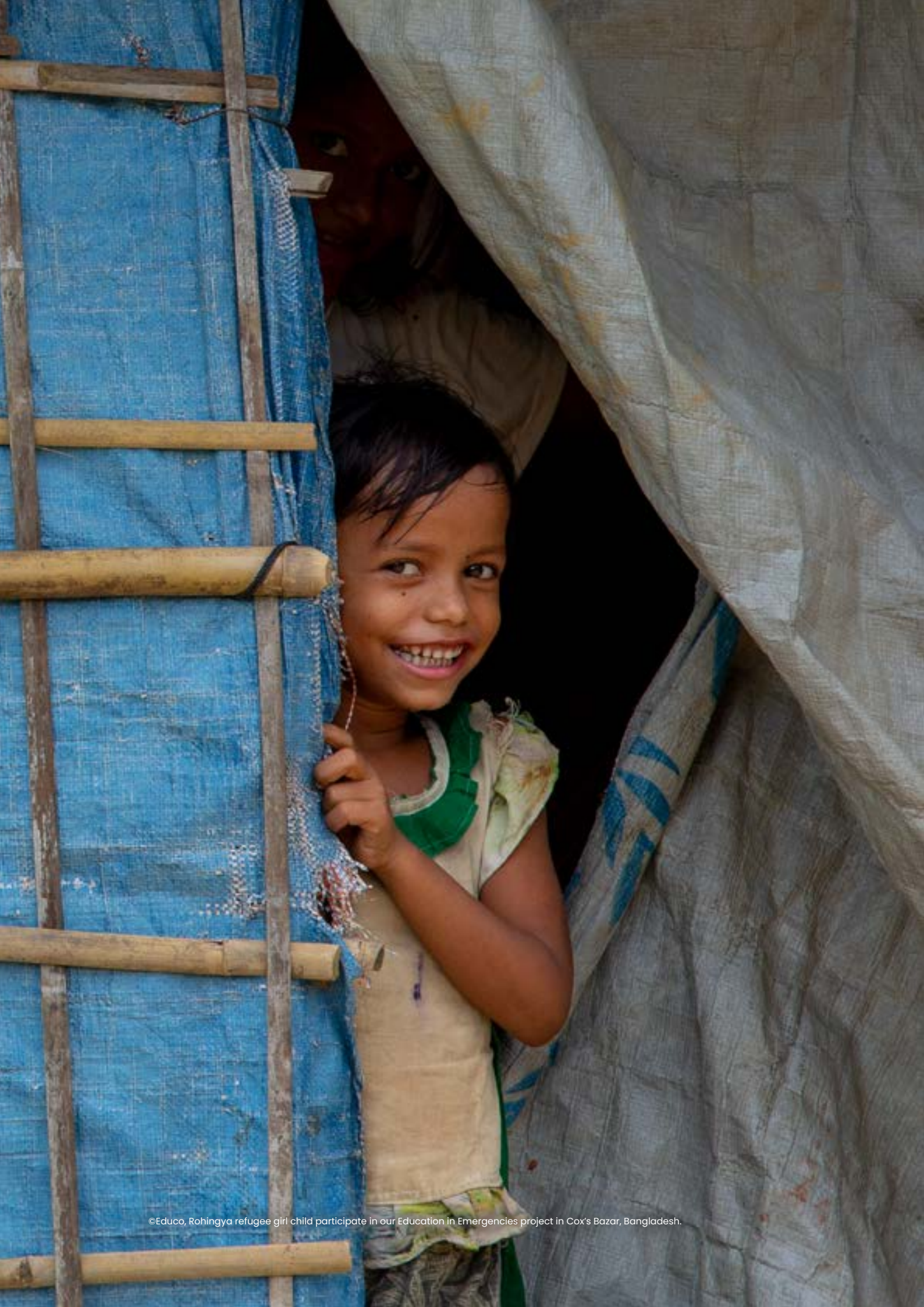
Rohingya refugee girl child participate in our Education in Emergencies project in Cox's Bazar, Bangladesh.