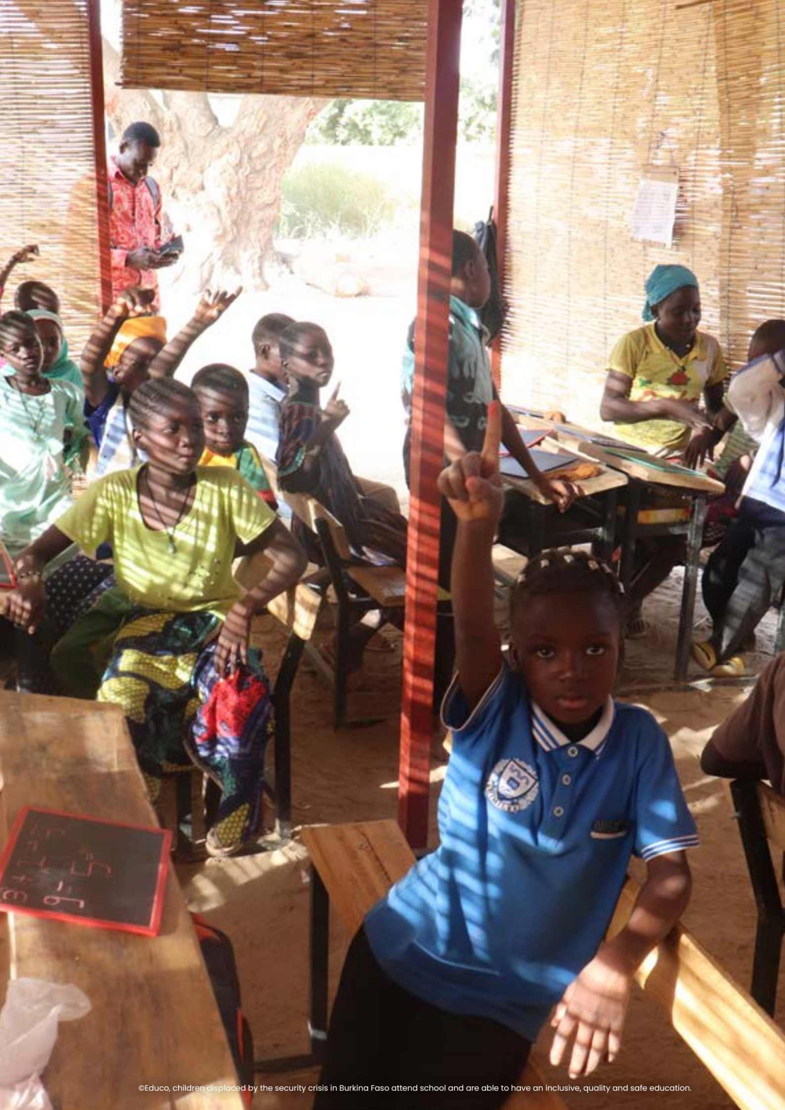
children displaced by the security crisis in Burkina Faso attend school and are able to have an inclusive, quality and safe education.