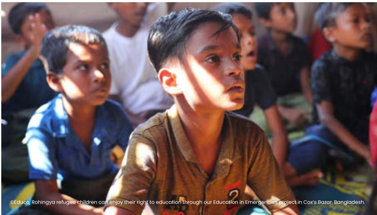
Rohingya refugee children can enjoy their right to education through our Education in Emergencies project in Cox's Bazar, Bangladesh.

We are facing an increasingly turbulent world, struggling with interlinked crises which last longer, with causes that are being diluted and consequences that are multiplying.