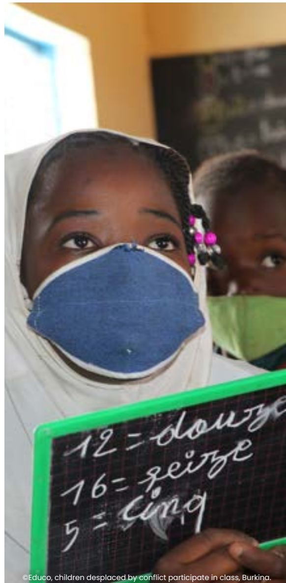
children displaced by conflict participate in class, Burkina.

This chilling situation particularly affects children, as 41% of the displaced population are children and adolescents (who represent 30% of the world's population). Specifically, 36.5 million children under the age of 18 were not living in their own homes in 2021. Of these, 13.7 million are refugees or asylum seekers and 22.8 million are internally displaced , the highest number since World War II (UNICEF, 2022). In addition, 7.3 million children and adolescents were forced to look for a new place to live in 2021 alone due to the scale of natural disasters.