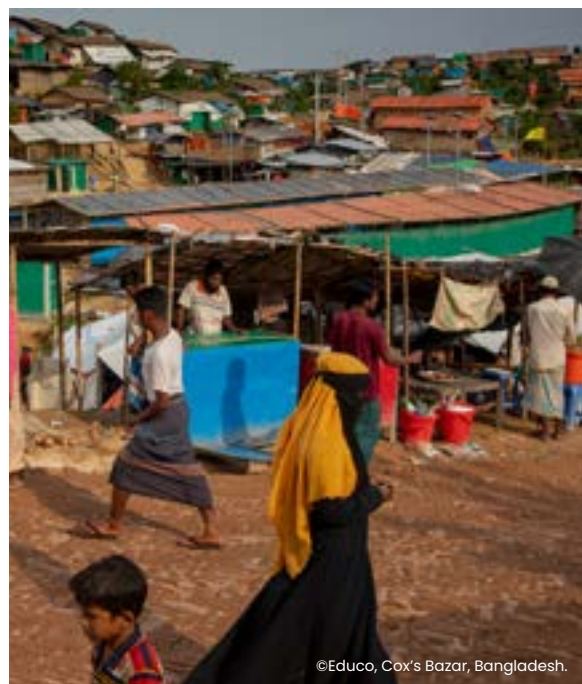
Cox's Bazar, Bangladesh.

stigmatisation and psychological trauma are the most common obstacles in education.