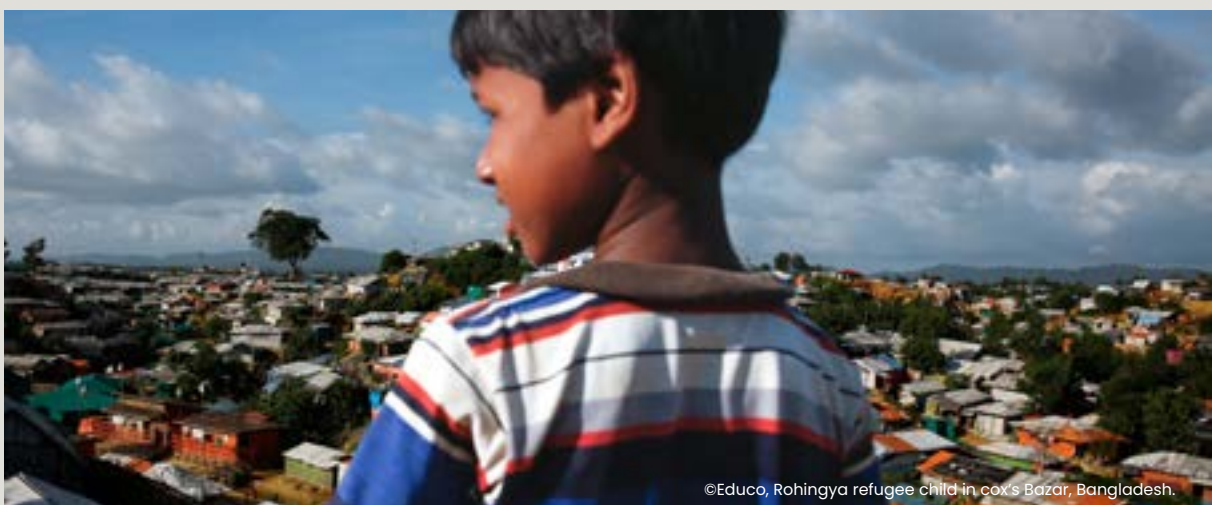
Rohingya refugee child in Cox's Bazar, Bangladesh.

Promote and highlight the EiE agenda in the different Unidas funds in order to make its relevance visible and improve its provision, while also increasing the emphasis on flexible funds.