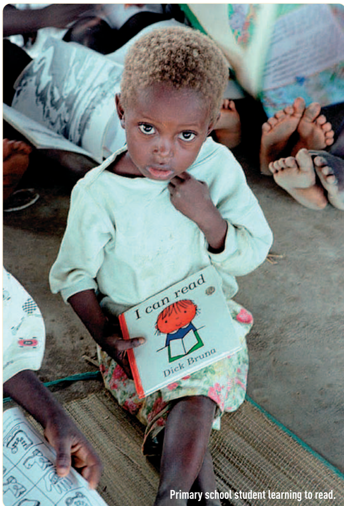
Primary school student learning to read.

focused on the recovery and development of its decimated infrastructure and social services, including the education system. In addition to its own challenges, Sierra Leone has over the years also hosted thousands of refugees from neighbouring Liberia. Currently there are approximately 50,000 Liberian refugees living in Sierra Leone (UNHCR, 2006).