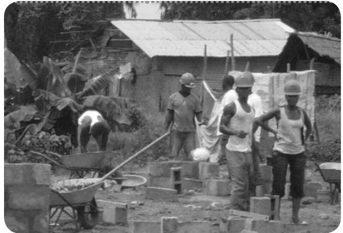
Young women and men participate in a construction project in Liberia.

Conflict-affected, displaced youth must often work to provide for their basic needs, often in unsafe situations. Our findings confirmed that displaced youth are economically active and contribute to multiple household livelihood strategies across displacement contexts, although paid work opportunities are particularly constrained in camp-based settings. Some camp-based young men living close to villages or towns in stable areas at times find work in manual labor, such as working in construction, transporting heavy loads of goods, herding animals or assisting in markets. Young women in camps near villages or towns sometimes work for low pay cleaning homes or washing laundry. Poorly