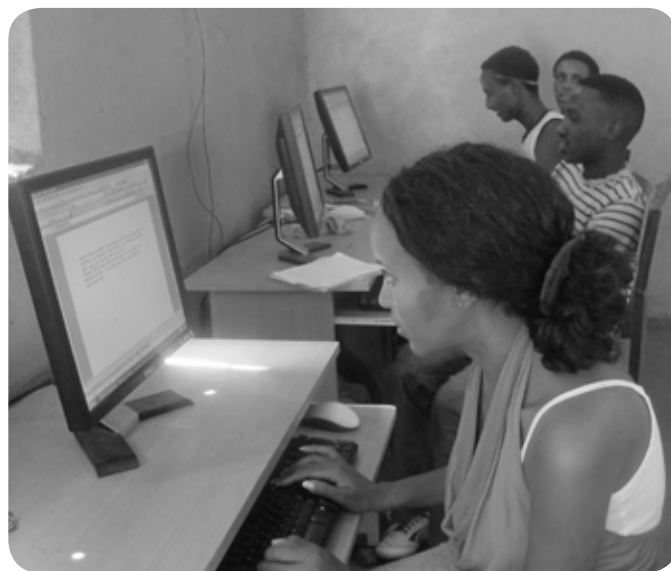
Computer classes are highly sought after.

Examples used to illustrate these three strategies were synthesized from the field assessment findings and recommendations and a desk review of programs.