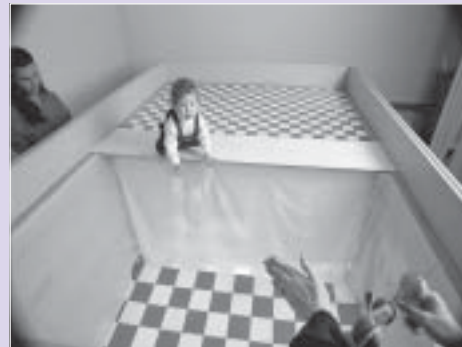
ELEANOR GIBSON (CORNELL UNIVERSITY)

Social referencing was first demonstrated on a piece of equipment called a visual cliff . This is made up of a flat glass surface on top of a deep end and a shallow end, with the two different depths separated by a narrow strip. Both the deep end and the shallow end are covered with a patterned surface, such as a checked fabric. Babies are put on the shallow side and encouraged to cross over to the deep side by offering an attractive toy. One-year-old infants immediately apprehend the drop-off and look to the mother's face before crossing the border and "going off the cliff" to reach the