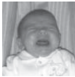
Children's facial expressions of emotional states