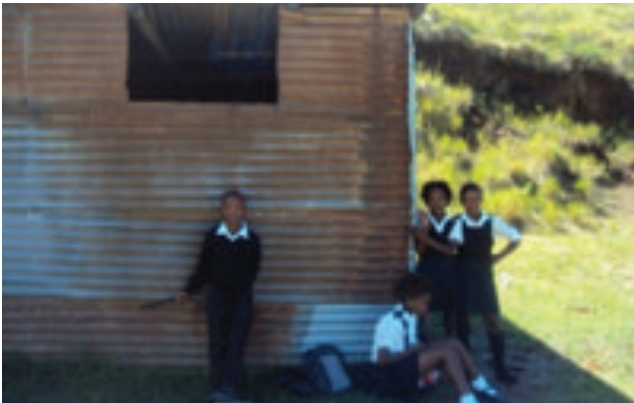
Image 2: Students outside their Junior Secondary School in South Africa.

Equalizers, EE's most active members, are at the center of much of its work. These high school students are from predominantly poor and working class areas. They engage with the organization through a variety of activities ranging from weekly youth groups, mass meetings, camps and marches. Equalizers play a leading role in the activities of the organization. They work with EE, along with parents, teachers, activists, and community members, to improve schools in their communities. They set an example to their peers through their dedication to their own education, and in addition to boosting EE's growing youth support, has helped to mobilize the support of parents and communities. Parent networks ensure that parents are informed and given a platform to support the advancement of equal and quality education in South Africa.