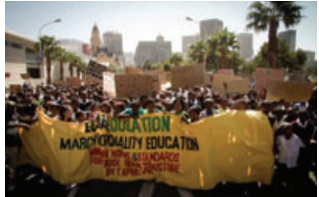
Image 3: 20,000 Equal Education activists march on Parliament on Human Rights Day, 2011.

Many parents have experienced negative or harmful school environments, having been educated under Bantu Education. These parents often felt intimidated and were less aware of what to expect from schools and government. To develop understanding of educational issues among parents and to encourage their support and action, Equal Education has run educational workshops with parents and involved them in campaigns, advocacy work and school based projects, such as supervised after-school homework classes.