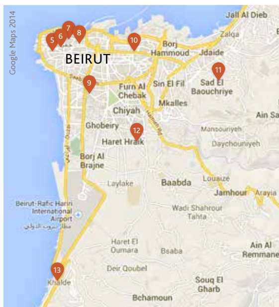
Maps of Lebanon and Beirut with universities where Syrian students interviewed were studying.