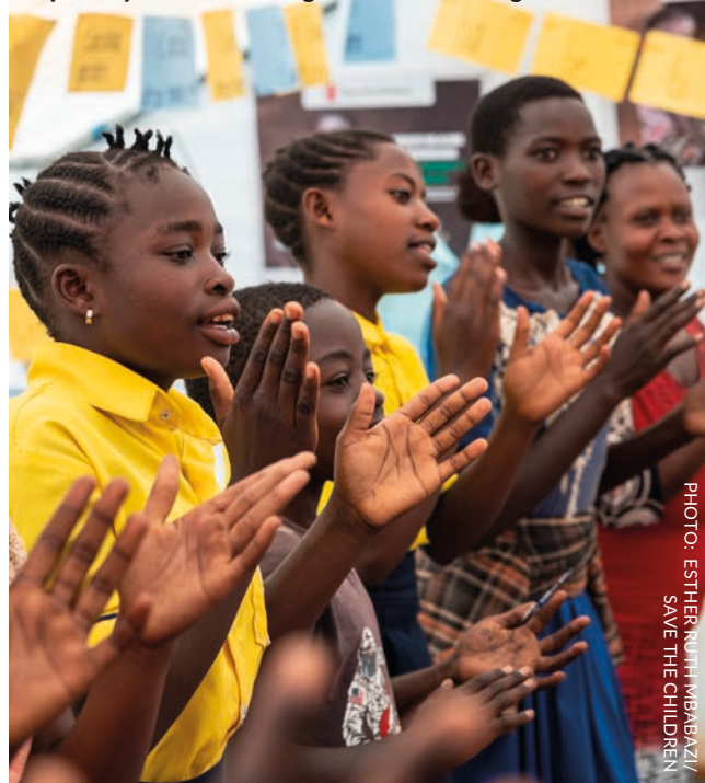
Children engage in Catch-up Club activities at a primary school in a refugee settlement in Uganda