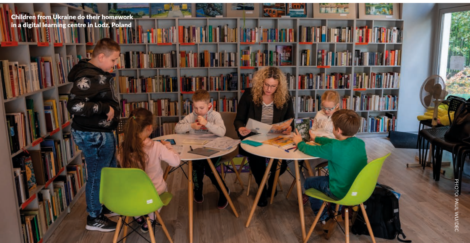
Children from Ukraine do their homework in a digital learning centre in Lodz, Poland

Although the way existing resources are used to further educational outcomes could be improved, fundamentally education needs more funding if we are to achieve the aims set out in Sustainable Development Goal 4, to ensure inclusive and equitable quality education and promote lifelong learning opportunities for all. The Education Commission found that under the most optimistic scenarios of domestic resource mobilisation and increased aid, there would still be a gap of at least US$20 billion by 2030. This is especially true for lower-income refugee-hosting countries, where the burden on already under-resourced education systems is the greatest.