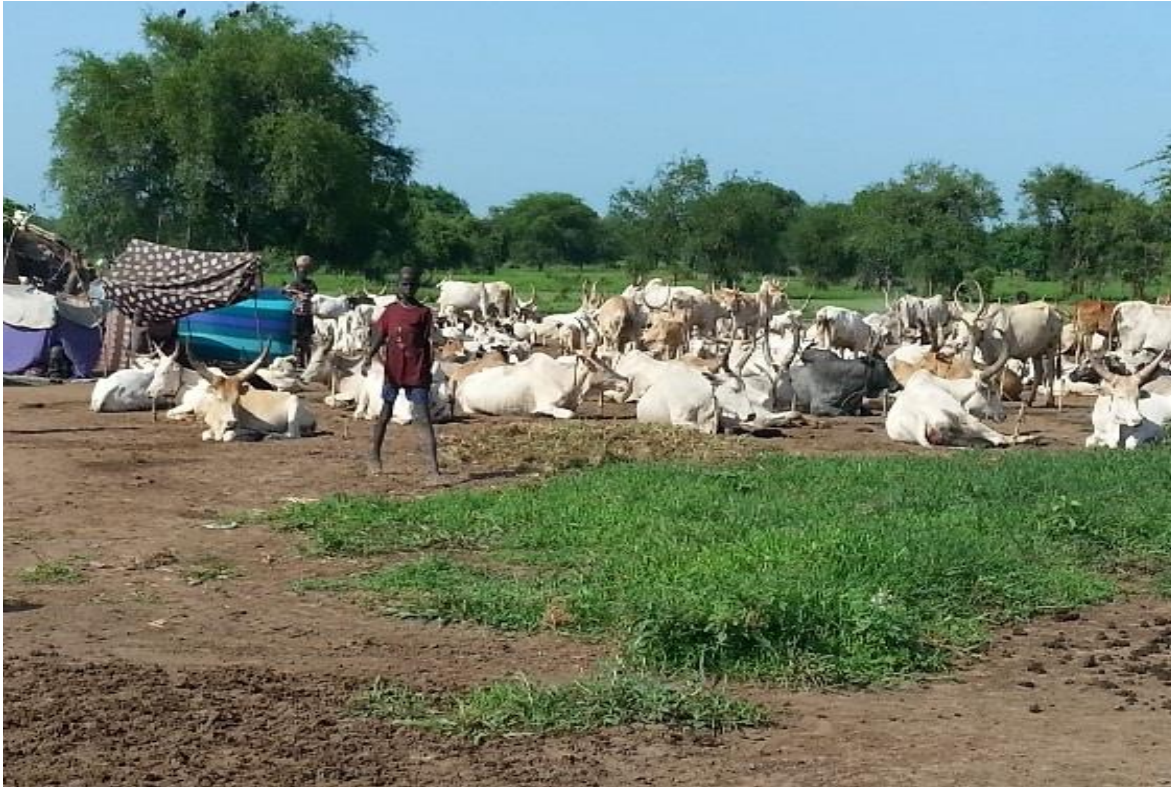
Figure 6. A cattle camp in Tonj East

of pastoralist conflict. In other words, attitude change cannot occur until it makes economic sense to individuals to give behavioural change a try. If mobile schools dispensing relevant life skills can give pastoralist children the opportunity to learn new competencies, and begin to envisage other livelihoods, education will have played a role in transforming structures of contention found in traditional livelihoods systems. But these skills and competencies must be those that are valued in the future South Sudanese political-economic system. The introduction of LS+PE for these communities is therefore about getting children and communities engaged in critical thinking about what causes conflict in their locality, and how their community can better respond to changes and shocks. Moreover, an assumption underpinning education development assistance in cattle camps is that the introduction of economically relevant learning opportunities for young people will address economic drivers of conflict among pastoral communities. In this light, UNICEF's engagement with pastoralist societies in the