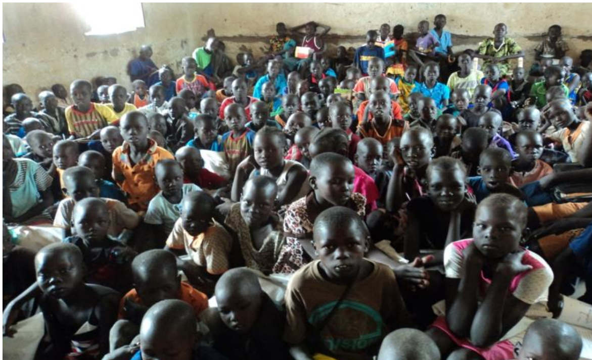
Figure 7. Congested classroom of Primary and ECD combined - Ngabagok Primary School

the Wau - Tonj East area. The July 2014 visit conducted by UNICEF personnel identified six volunteers from the cattle camps willing to run such education groups and one had already started the same month. The government has established some mobile schools with many more being planned, but the limiting factor is typically teachers. It is very difficult to find teachers willing to travel and accept the rigors of life in the cattle camps. An alternative using 'volunteers' has been to establish schools where pastoral communities are expected to travel (i.e., along their migratory routes). As cattle camps are set up for two to three months at a time before moving to a new location, pastoral pupils could shift to fixed schools over the course of the year, joining pupils that are either sedentary at that point or moving with other cattle herding groups. Not only will this approach ensure a continuity of their education and retain quality, it permits children to make friendships in different communities and across ethnic and clan lines, and renew those social contacts on a regular basis as they grow up. 47 In support of this pilot model in South Sudan, the participating volunteers