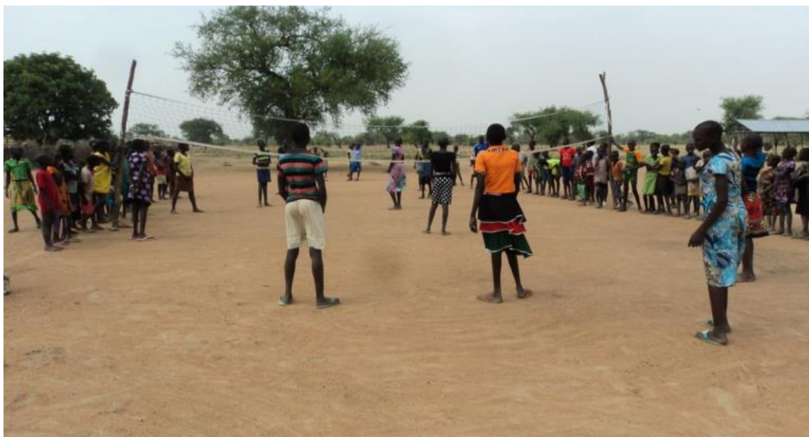
Figure 9. Volleyball game in Kacuat Primary School.

hold is very powerful. A man who has been educated will prefer to marry a girl that has never been to school. But I think in some communities it is now changing, because they are beginning to see it's important to train them. But after a time they drop out, when a man appears who is ready to pay many cows for them. So you find that they begin very well, and then after a time they [the rates of female schooling] continue to drop. 50