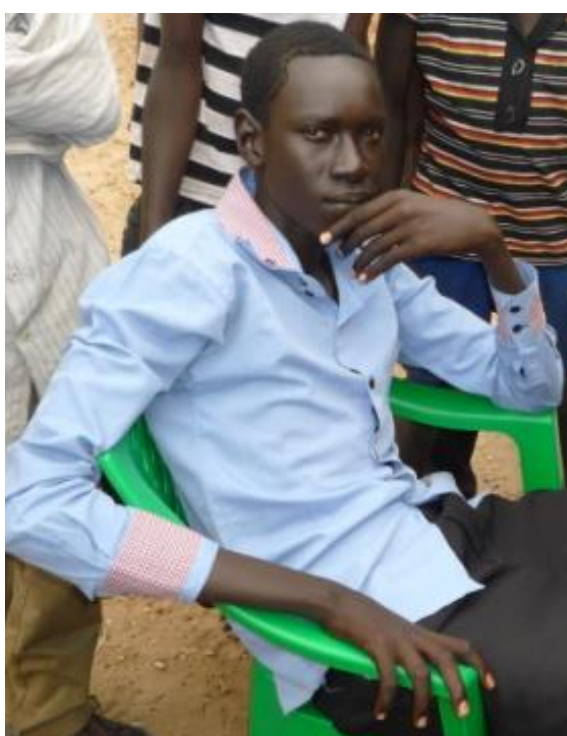
Figure 8. Though over age, this Lologo student from Jonglei is determined to become a doctor

were highly motivated and immediately started mobilising children in their cattle camps to begin schooling, with more than 500 children to participate in these informal classes (i.e., thus demonstrating progress with PBEA Outcome 4 ). While preliminary results such as these are quite encouraging with increasing children's access to relevant quality education, UNICEF staff identified availability of teaching and learning materials as ongoing bottlenecks to the success of this initiative – thus potentially undermining the sustainability of this approach (i.e., as with UPE in several countries across Africa, the initial progress with enrolling children into education in cattle camps can suffer reversals due to supply and quality factors).