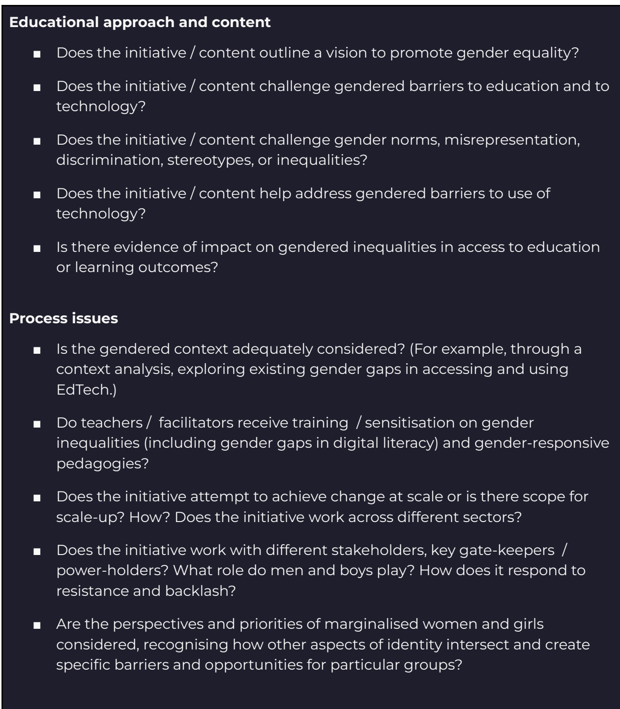
Figure 2. Checklist to help EdTech initiatives strengthen transformative impacts on gender equality.

Figure 3 below maps some of these elements onto the gender transformation continuum, to explore what, in practical terms, these principles could mean in the context of EdTech.