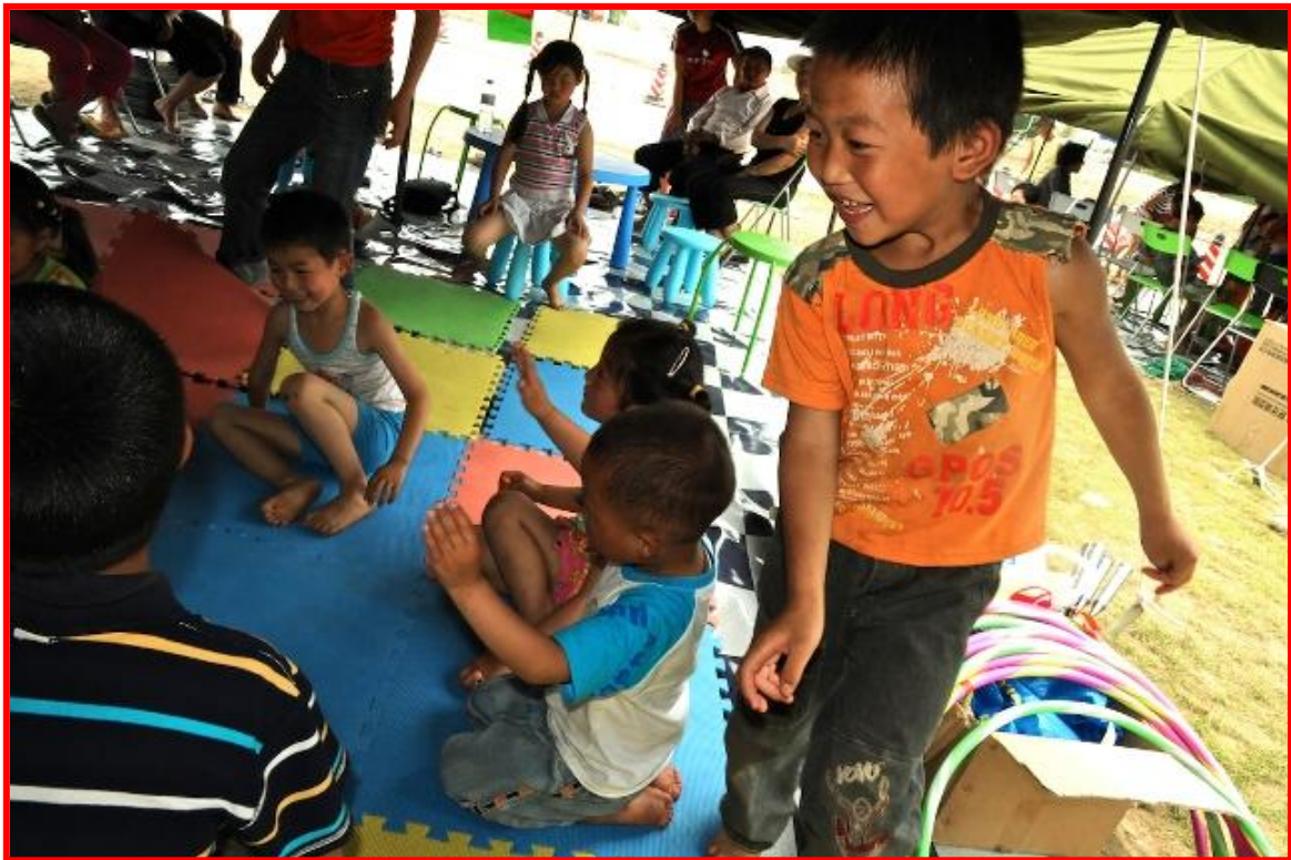
Children affected by the Sichuan earthquake play in a Save the Children Child Friendly Space