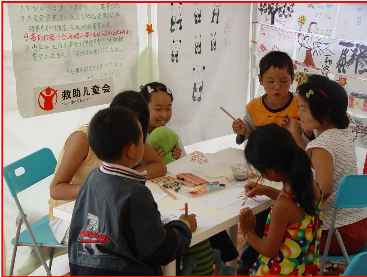
An art corner in a Child Friendly Space in Sichuan Province, China