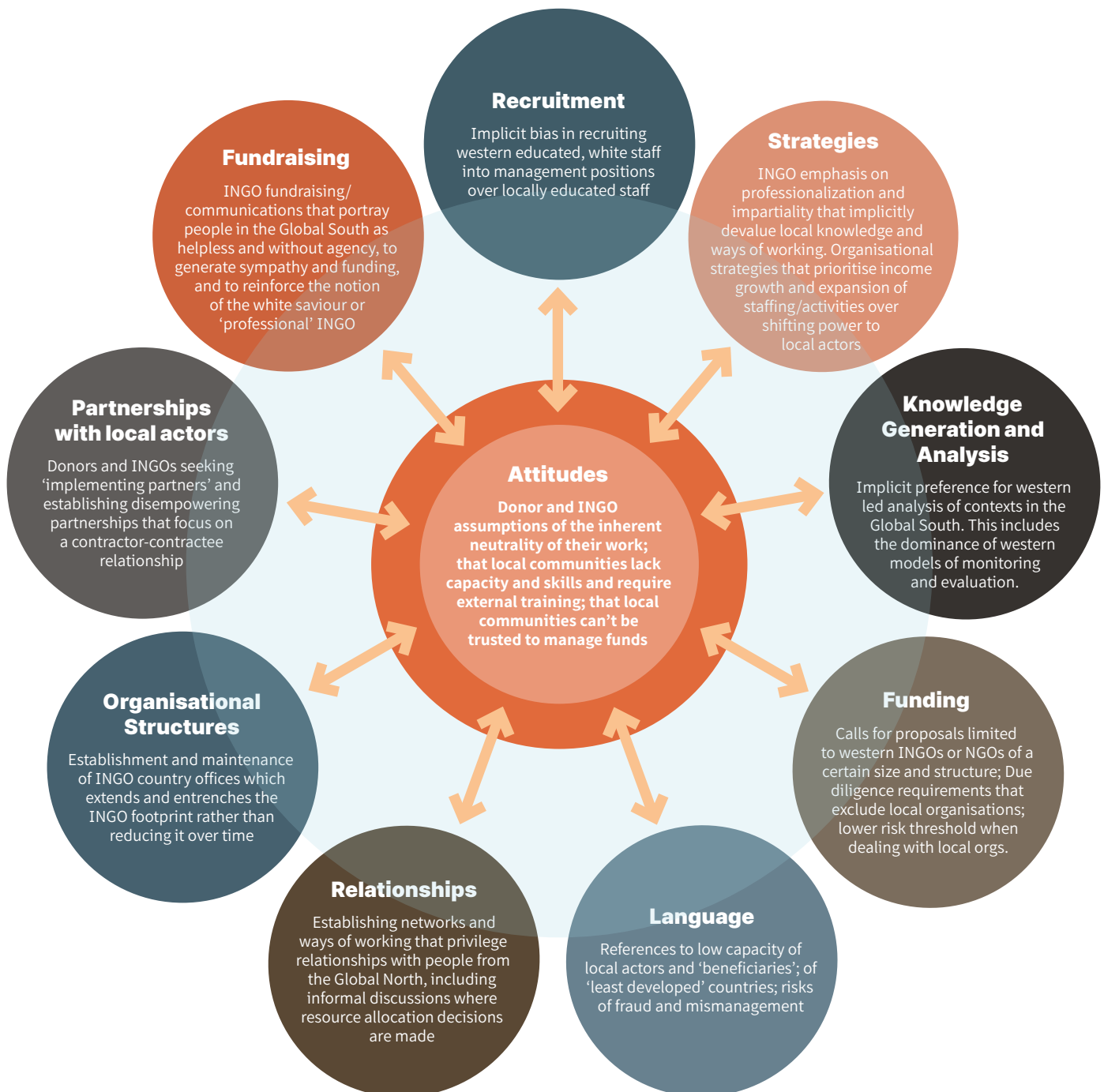
Diagram How structural racism shows up in the sector