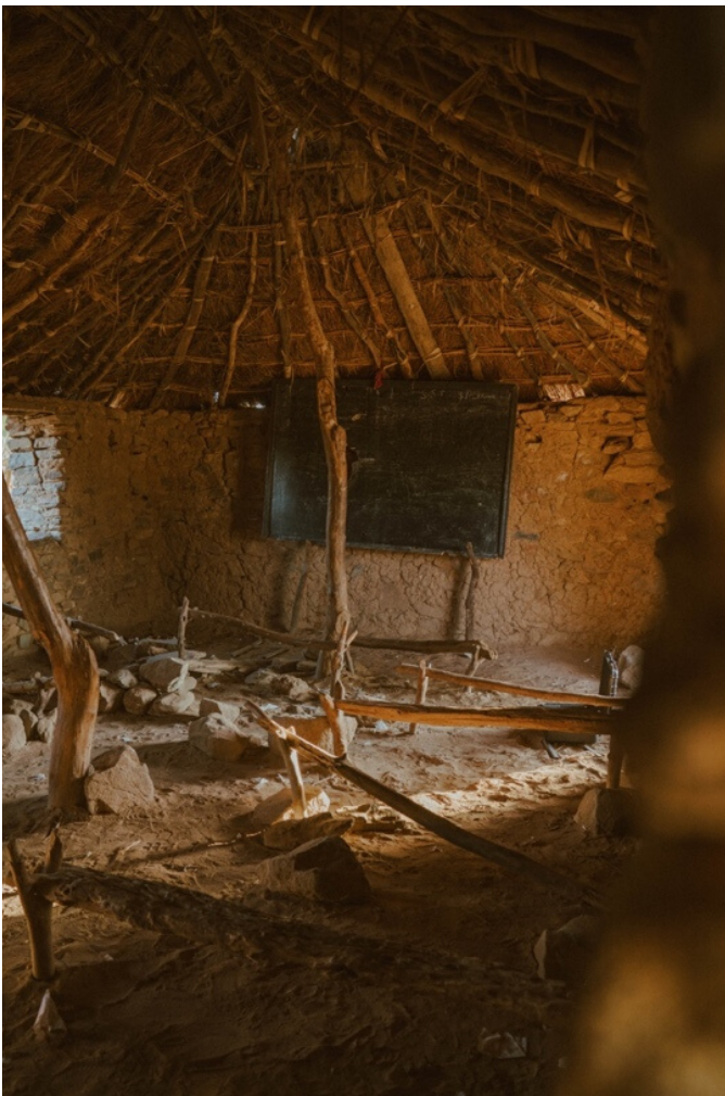
A classroom in the Nuba Mountains

Due to the lack of education data for the region, To Move Mountains, a small non-governmental organization with a high level of rapport across the Nuba Mountains, conducted a mixed methods study in 2019. The study, which included a literacy and numeracy assessment of 273 8- and 9-year-old children throughout the region, revealed significant educational needs. Findings showed that none of the children sampled met grade-level proficiency for reading. Less than 32% of those children could identify three given numbers between 1 and 20. Even fewer could perform basic addition and subtraction.