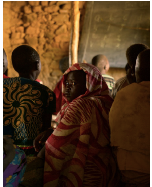
A girl in class in the village of Kujur Shabia