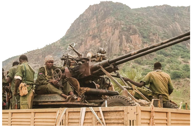
Soldiers in the Nuba Mountains