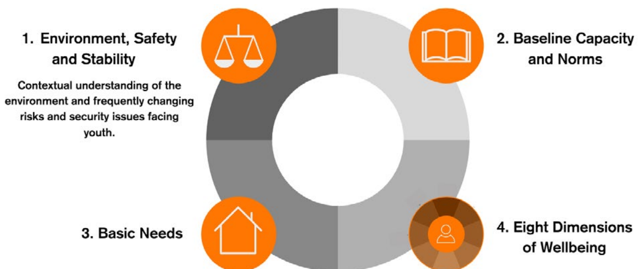
Figure 1: NRC youth wellbeing in displacement framework

The case studies revealed these categories must be considered in specific location . In other words, to capture what youth wellbeing in context means, programmes must consult with youth about the context and environment; basic needs; and baseline capacities and norms (categories 1-3) and the ways these interact with the individual dimensions of wellbeing (category 4) in that context . 9 The four categories are not bounded boxes. Rather, they are a conceptual map of important pieces of a puzzle that interact in diverse and changing ways. These pieces are deeply interconnected, and interrogating these connections is a critical step to examining and describing wellbeing in a given context.