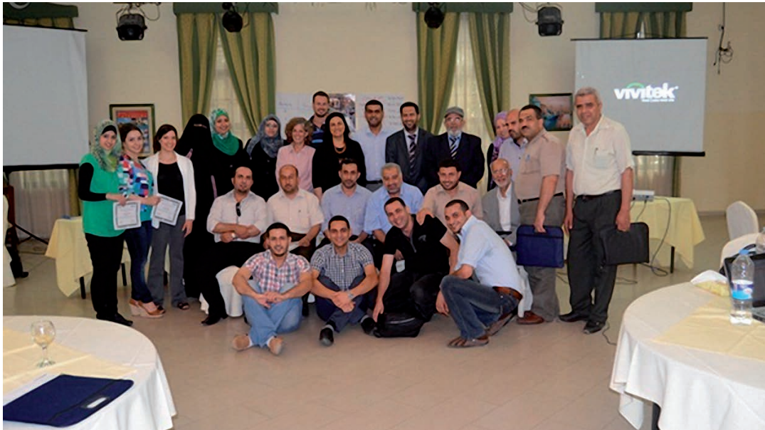
Participants of the Gaza Workshop (June 2013)