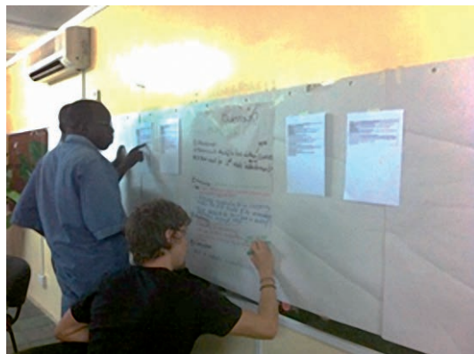
Participants from the Ministry of Education (left) and UNICEF (right) review the contextualized standards.