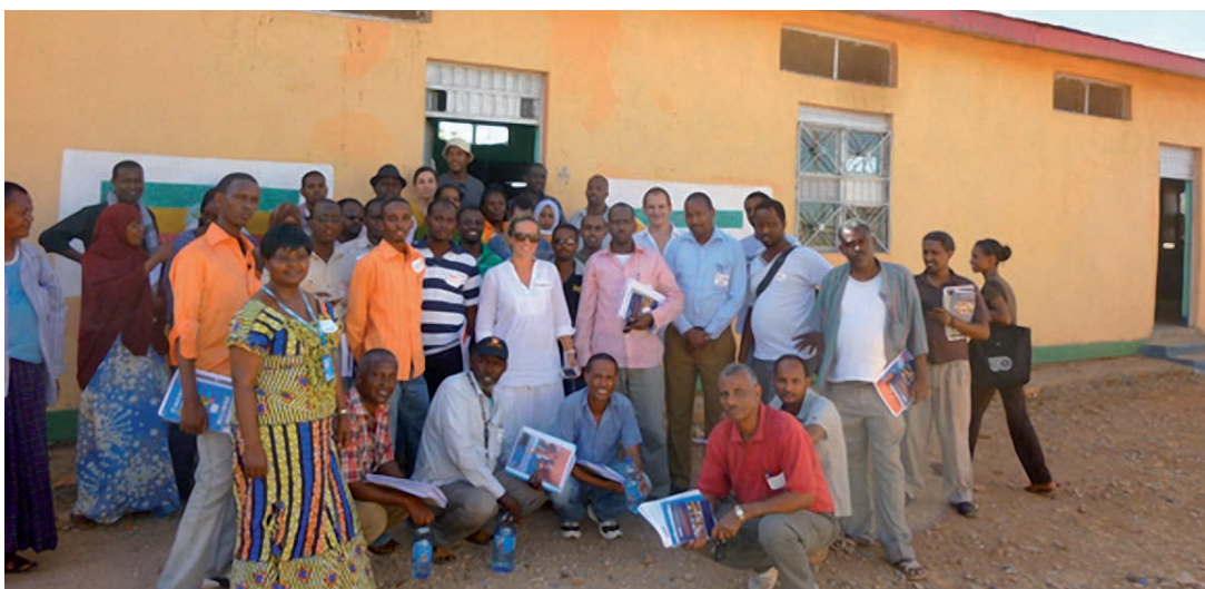
Adama, Ethiopia (Feb 2013)

The contextualization process can be used as a window of opportunity for other INEE related processes, i.e. institutionalization of INEE MS and other network tools, case study production, and advocacy.