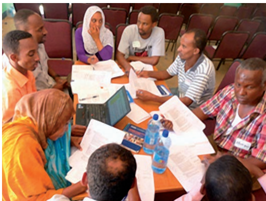
Dollo Ado, Ethiopia (Feb 2013)