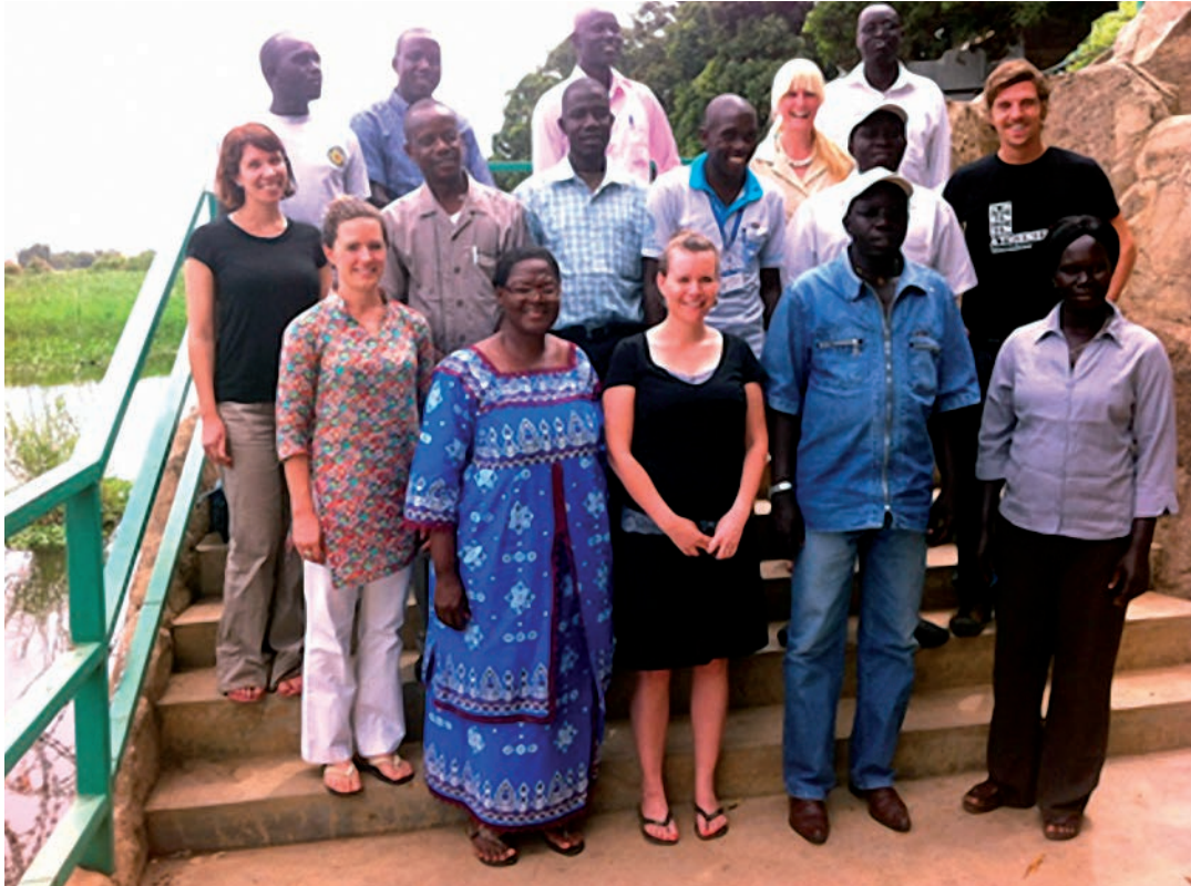
Juba, South Sudan (March 2012)