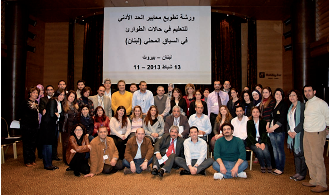
Beirut, Lebanon (Feb 2013)