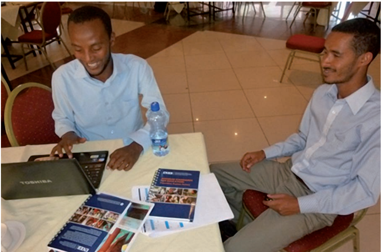
Adama, Ethiopia (Feb 2013)

Contextualization should not lower the Standards, given the difficult context, or alter the rights-based foundations on which the Standards are based. Instead, contextualization should aspire to reaching comparable rights-based objectives articulating the Standards using the most relevant, comprehensive, and user-friendly language.