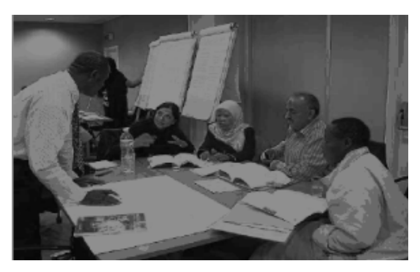
Participants developing response strategies and monitoring plans at the INEE-IRC-UNGEI-UNICEF global training on ensuring gender equality in and through education in emergencies and fragile contexts, September 2008.

We would like to take this opportunity to express our sincere appreciation to you and your colleagues from INEE for your kind support and cooperation which made the translation possible. We are now in the process of discussing with the Ministry of Education about the training on the Minimum Standards and are mobilizing funds from all possible sources.