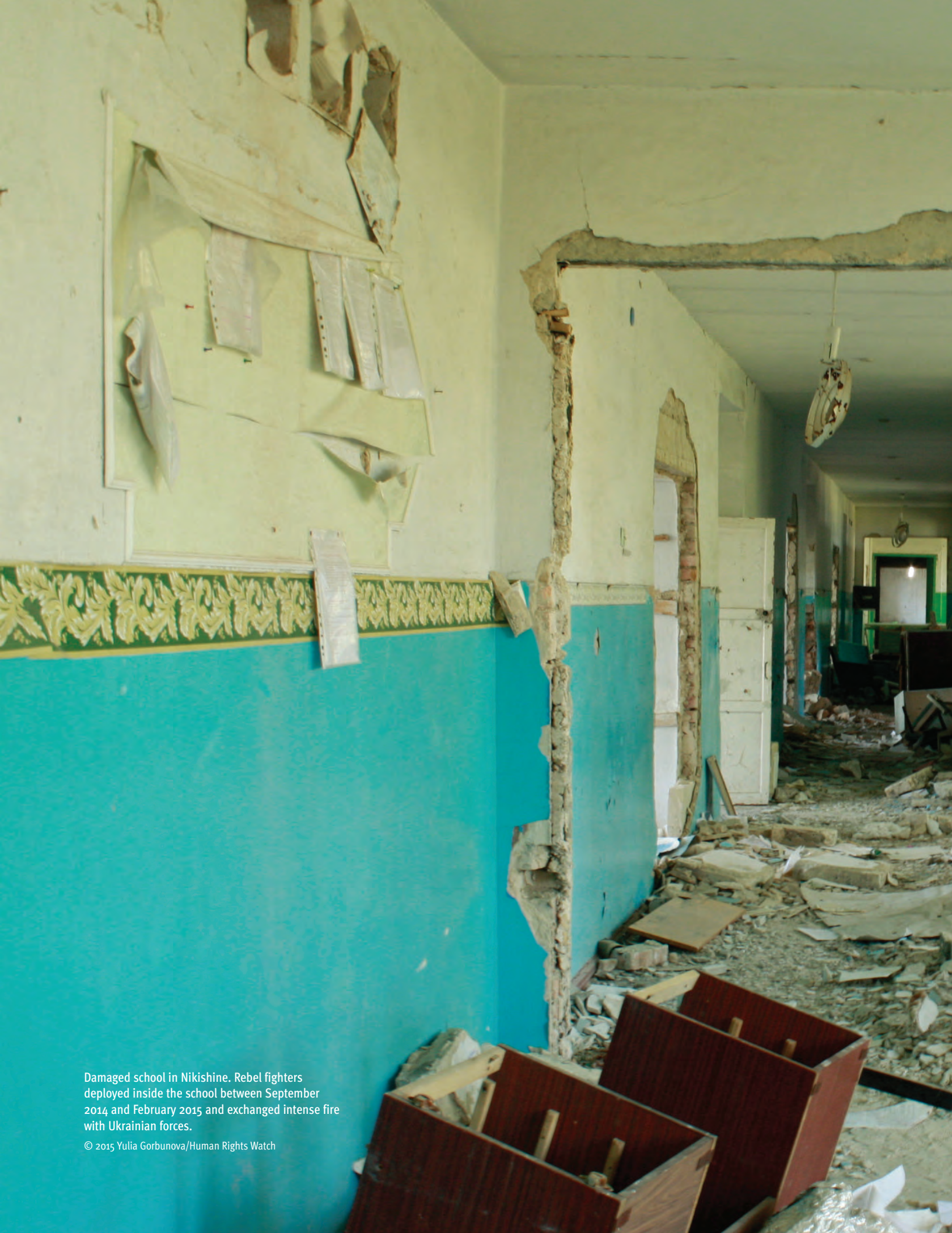
Damaged school in Nikishine. Rebel fighters deployed inside the school between September 2014 and February 2015 and exchanged intense fire with Ukrainian forces.