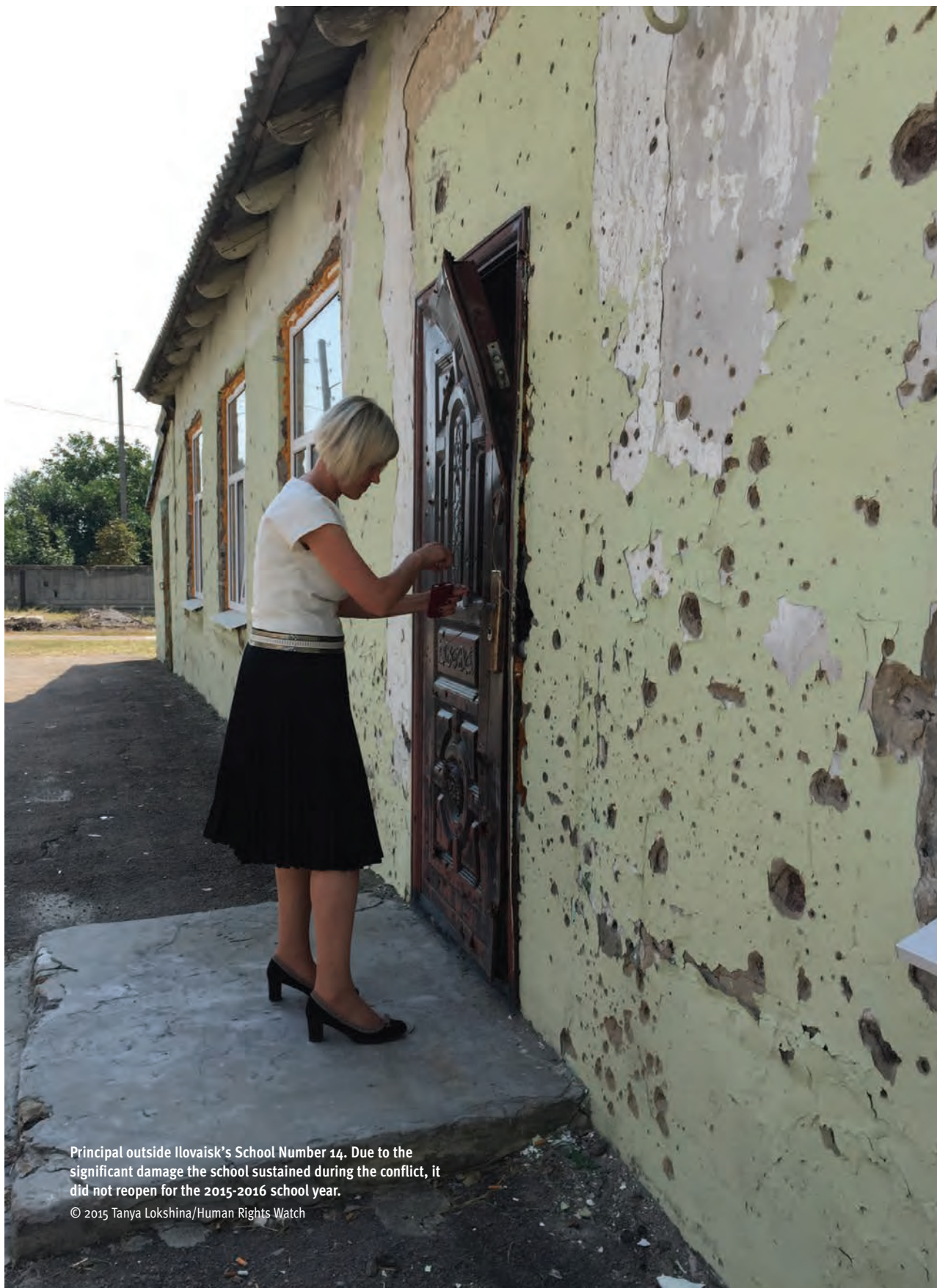
Principal outside Ilovaisk's School Number 14. Due to the significant damage the school sustained during the conflict, it did not reopen for the 2015-2016 school year.