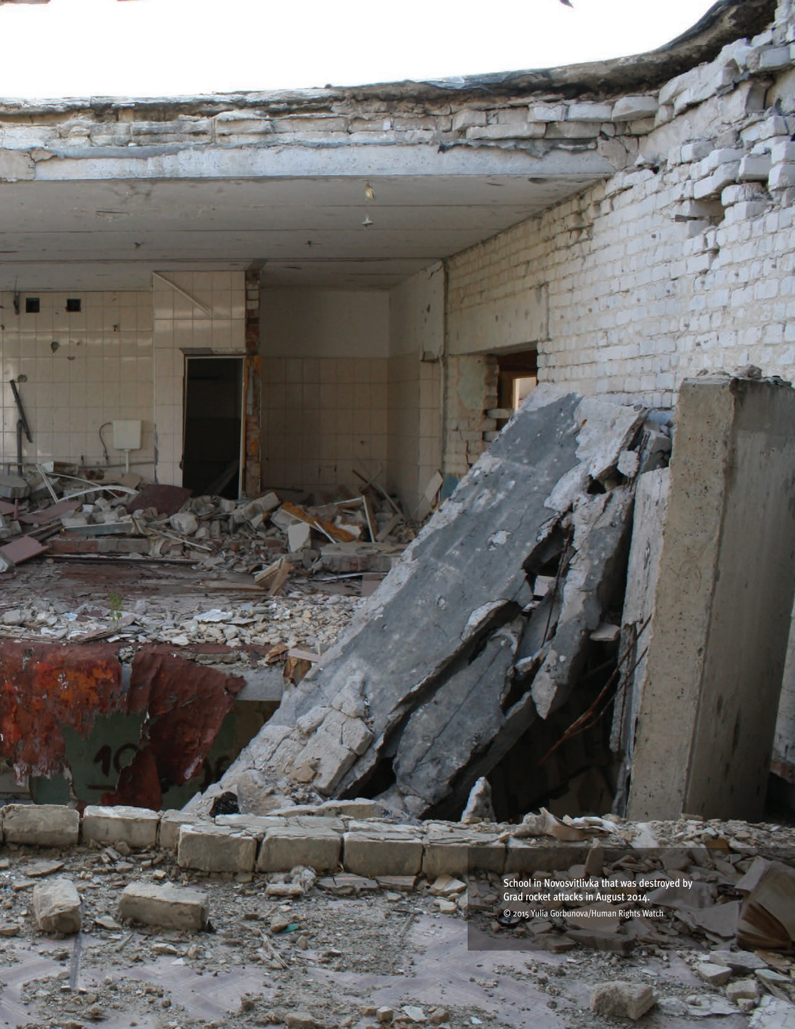
School in Novosvitlivka that was destroyed by Grad rocket attacks in August 2014.