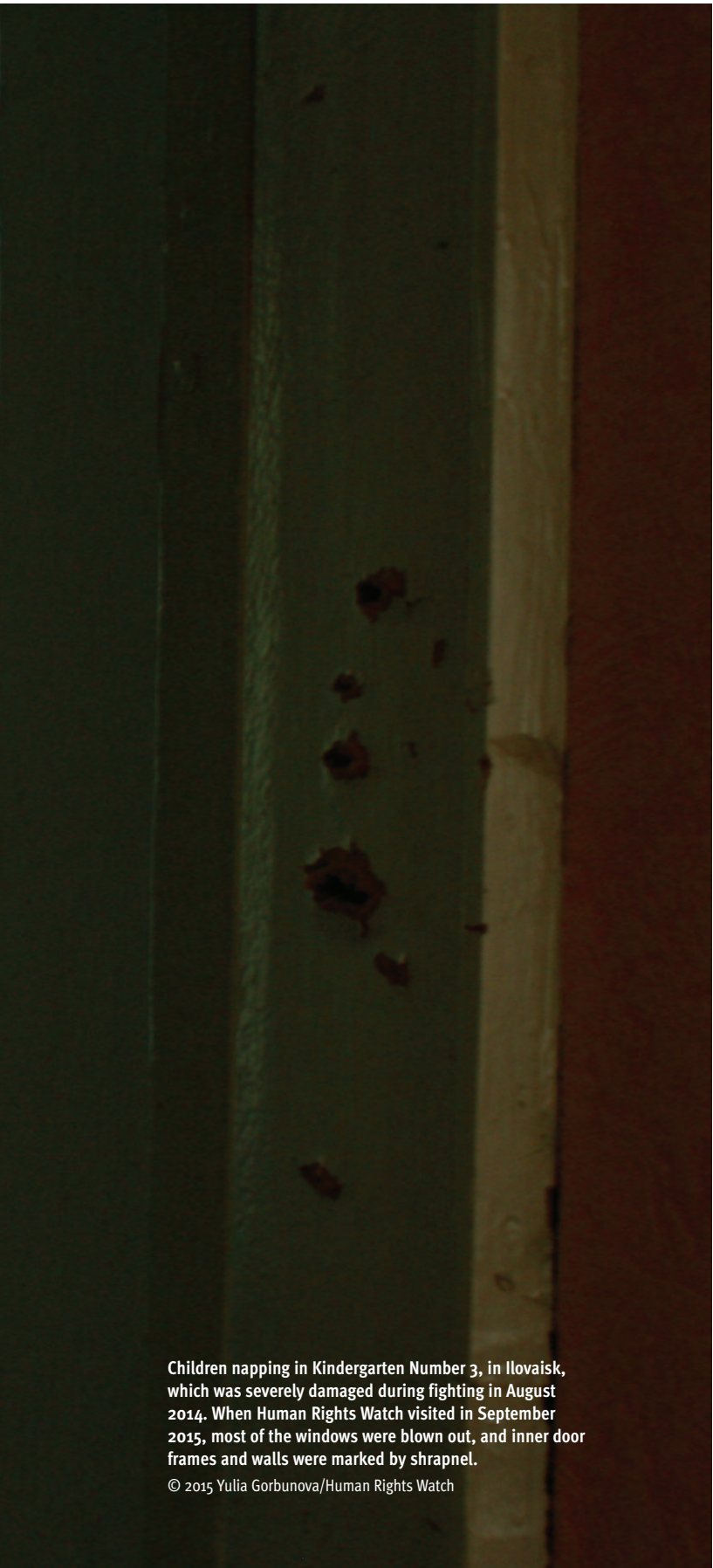
Children napping in Kindergarten Number 3, in Ilovaisk, which was severely damaged during fighting in August 2014. When Human Rights Watch visited in September 2015, most of the windows were blown out, and inner door frames and walls were marked by shrapnel.