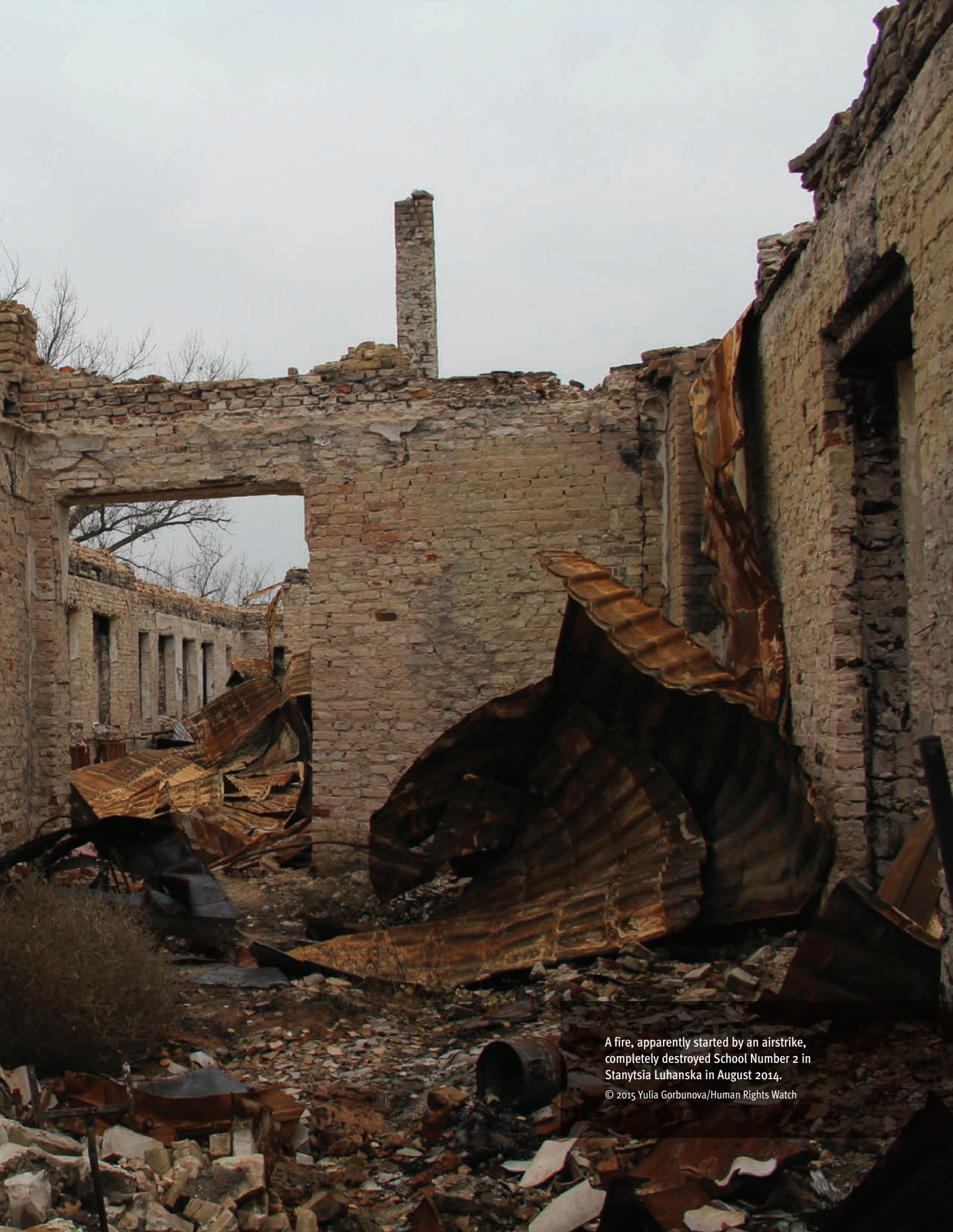
A fire, apparently started by an airstrike, completely destroyed School Number 2 in Stanytsia Luhanska in August 2014.