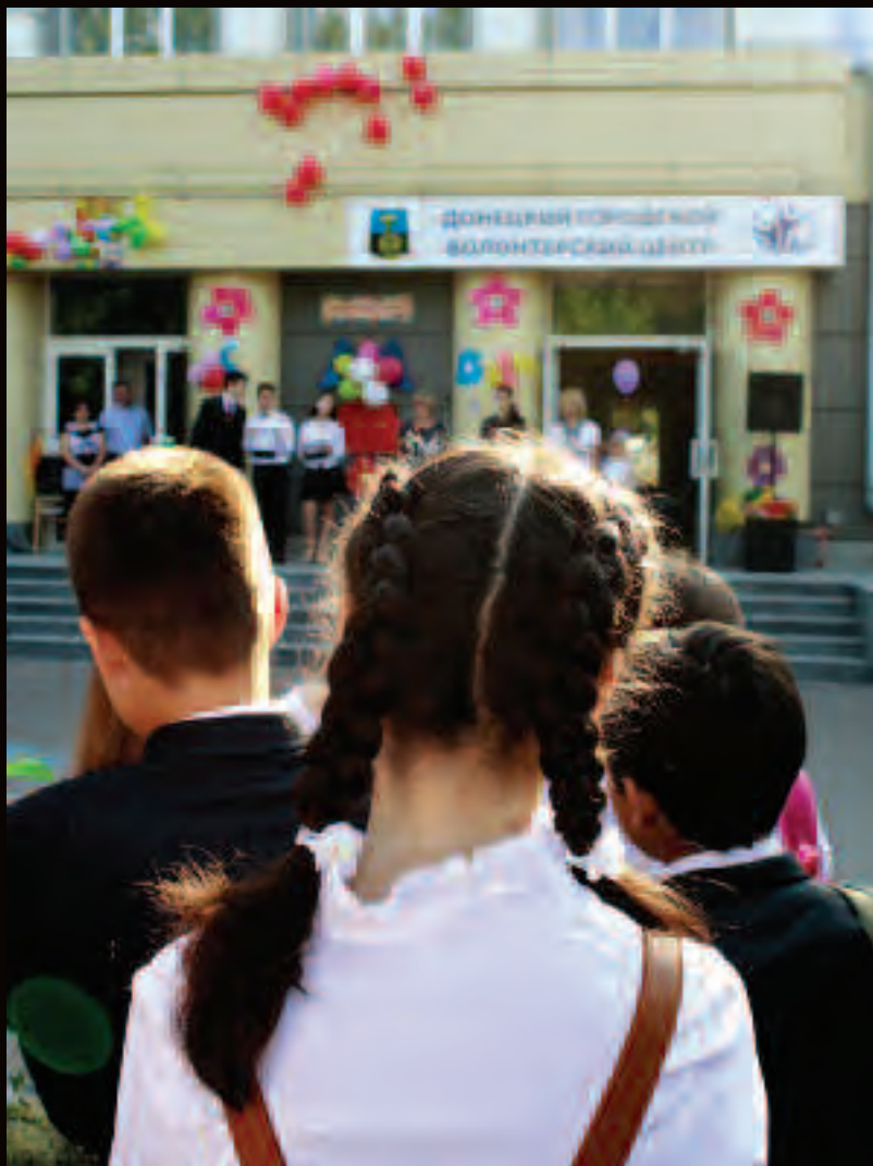
(above) The “First Bell” ceremony at School Number 2 in rebel-held Donetsk, marking the beginning of a new school year.

Human Rights Watch urges both Ukrainian authorities and Russia-backed militants to cease all attacks against schools that do not constitute military objectives and avoid deploying inside or adjacent to schools and kindergartens. Ukrainian authorities should deter the military use of schools by, among other things, endorsing the UN Safe Schools Declaration.