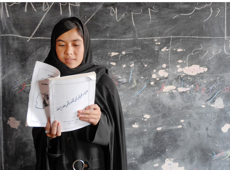
Students in a Healing Classrooms program in Herat, Afghanistan are made to feel safe, cared for and supported.

Concretely, a three-tiered approach for promoting the social and emotional well-being of children and youth should focus on: (i) classroom and school climate, (ii) teaching pedagogy and school personnel support and (iii) student skill building.