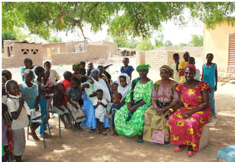
Parents’ participation in school planning helps promote SEL, such as these mothers from a community school in Mali.