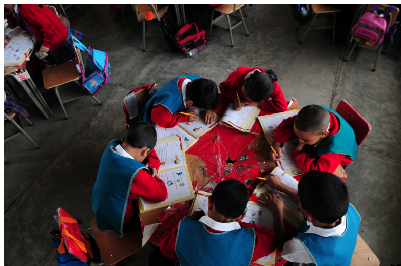
Children learn to work together at school in Villa Nueva, Guatemala.