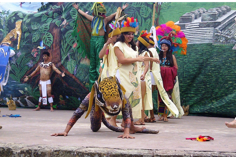
The youth theater group of teaching students in Honduras is focused on the mayan cultural traditions in the Central American region.

In addition to what we already know about education quality (such as qualified teachers, appropriate class sizes, etc.), learning in contexts of adversity requires an additional set of social and emotional moderating factors (strength and direction of learning) as well as mediating factors (why and how children learn). This integrated understanding into how learning can be supported in contexts of violence and conflict has important policy and program implications, as presented on the next page.