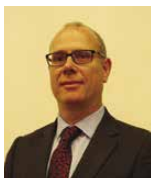
Adrian Chadwick OBE Regional Director, British Council, Middle East and North Africa

The importance of language in the context of mass movement of people and ideas across national, cultural and linguistic boundaries is unquestioned. Now, with more than 65 million people forcibly displaced in the world, it is more important than ever.