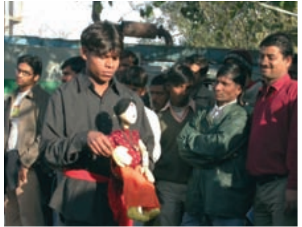
© The Ishara Puppet Theatre Trust

The project seeks to develop new partnerships and has responded to several requests already. It is now involved in the training of others in simple puppet making and performing for similar socio-educative programmes.