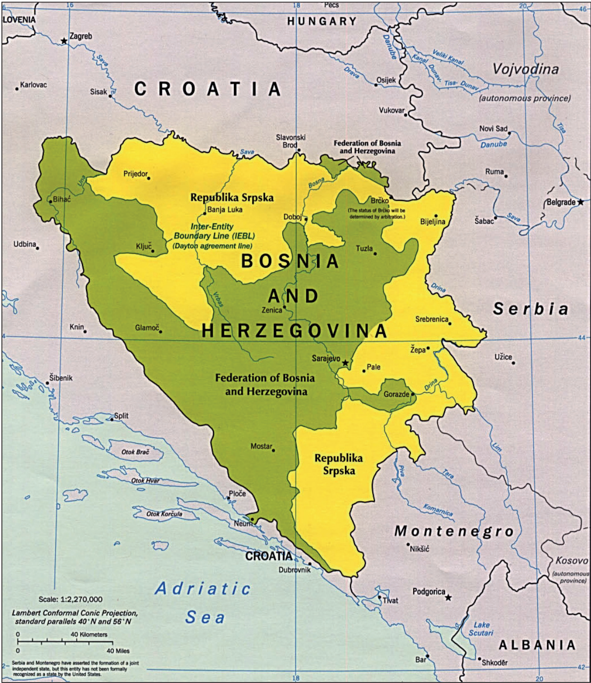
Figure 1. Map of post-war Bosnia and Herzegovina